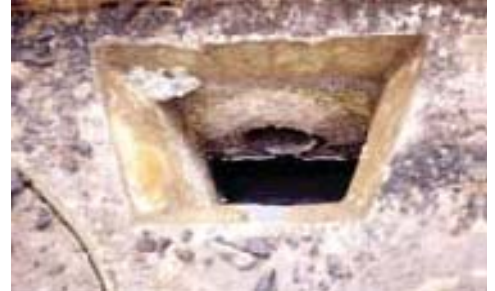
In this picture, looking down an outlet baffle, the effluent is below the pipe, indicating a bad seal.